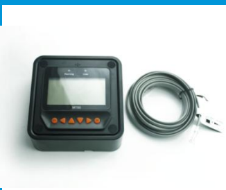
Remote meter MT50